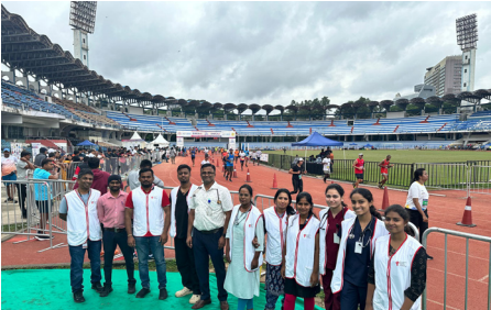
24 Hour Stadium Run, BBH was the official medical partners of NEB sports